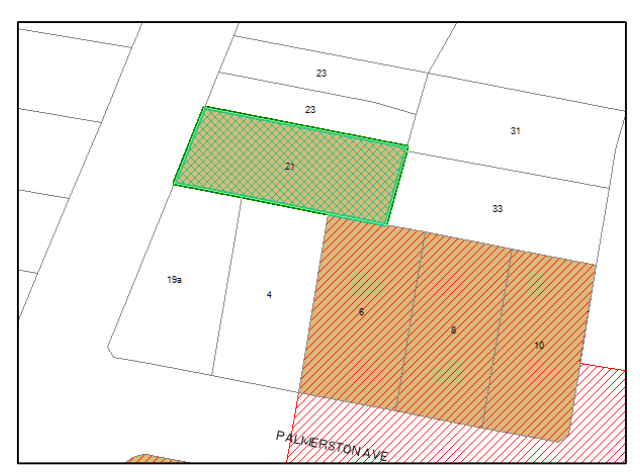
Figure 2 - Existing heritage map extract of 21 Brown Street, Bronte

Action: Remove brown fill from No. 21 Brown Street, Bronte (identified with green hatching)