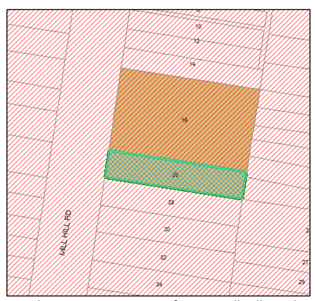
Figure 1 – Existing heritage map extract of 16-26 Mill Hill Road, Bondi Junction

Action: Remove brown fill from No. 26 Mill Hill Road, Bondi Junction (identified with green hatching)